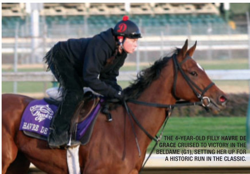
THE 4-YEAR-OLD FILLY HAVRE DE GRACE CRUISED TO VICTORY IN THE BELDAME (G1), SETTING HER UP FOR A HISTORIC RUN IN THE CLASSIC.

Three key prep races—the Kelso Handicap (G2), the Beldame (G1), and