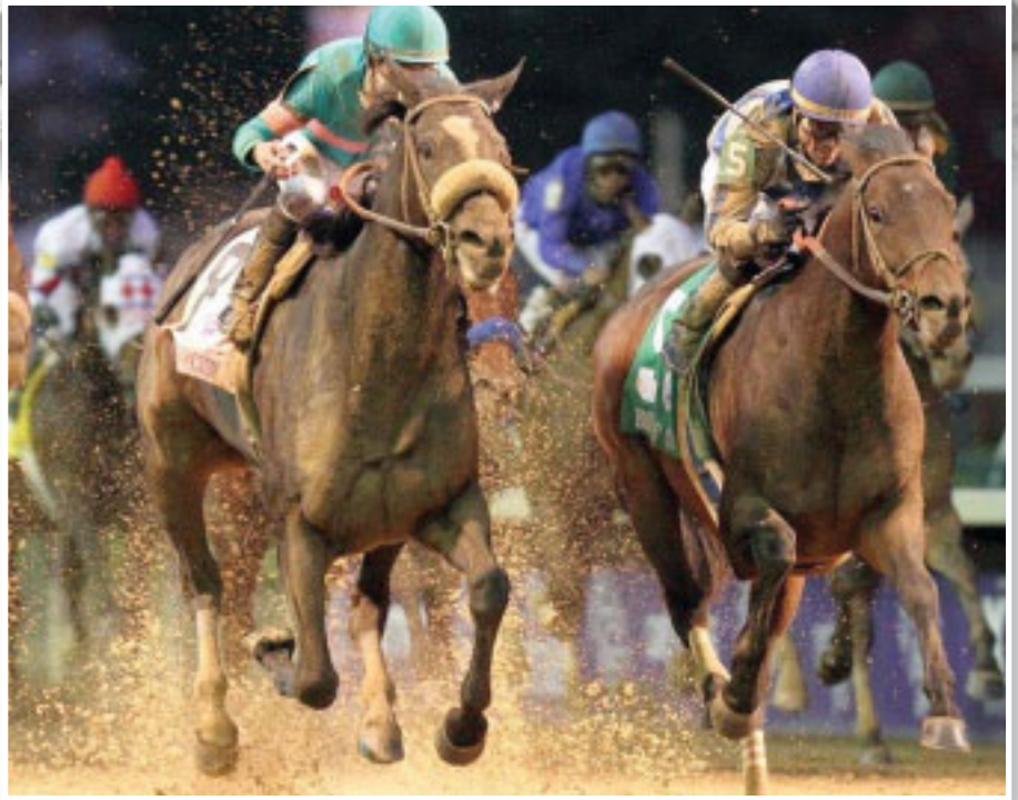
LAST YEAR'S CLASSIC WAS A THRILLING SHOWDOWN BETWEEN ZENYATTA (LEFT) AND BLAME (RIGHT).

Evidently, it does not matter which American track a horse uses as a springboard to the Breeders' Cup at Churchill, since each of the seven horses listed above employed a different path to their Classic triumph in Louisville.